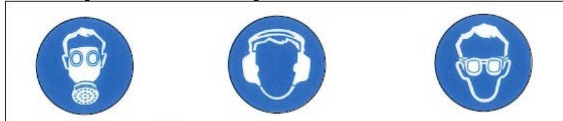
wear breathing mask